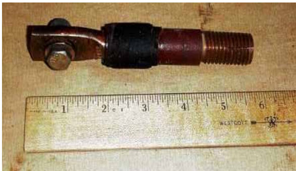
Collector Ring Connector (1) - Size: (3/4" x 5 3/4")