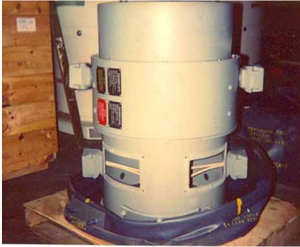
Exciter Field (Box 1)

Approximate Dimensions: 3'6" L X 3' W x 3'8" H Approximate Weight: 1,100 lbs.